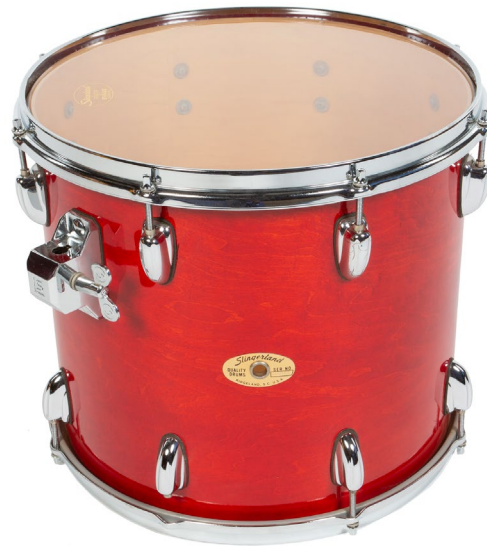
1990 Slingerland lite prototype drum with red stain finish