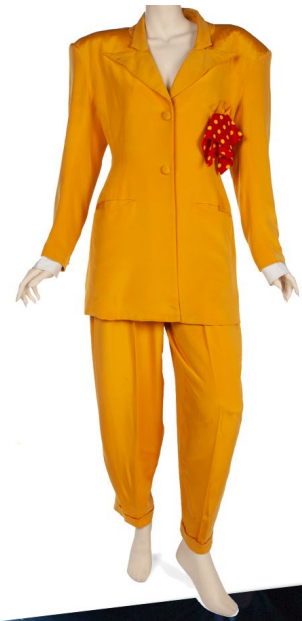
(photo right: The Jackson Family Honors TV special "Alright" performance costume)

Jackson's lead single, "Rhythm Nation," whose socially conscious lyrics called for unity, became a touchstone due in part to its famous military style choreography and black and white depiction in its Grammy Award winning landmark long form video. Jackson's military ensemble in the video firmly established her status as a fashion icon and is considered one of the most iconic and popular music videos of all time. Rhythm Nation 1814 became the highest selling album of 1990, winning a record fifteen Billboard Awards with the Rhythm Nation World Tour 1990 becoming the most successful debut tour in history, selling out in 3 continents (USA, Europe, Asia). "Rhythm Nation" received nine Grammy Award nominations and Jackson became the first female artist to be nominated for Producer of the Year in 1990.