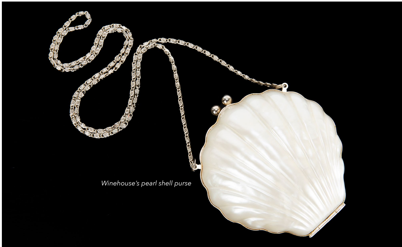
Winehouse's pearl shell purse