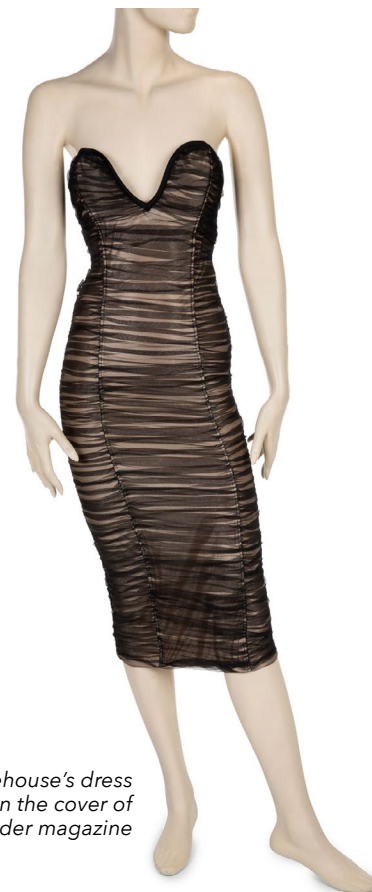
Winehouse's dress worn on the cover of Blender magazine

The album was released in the UK on October 30, 2006, and went to number one on the UK Album Charts and became the best-selling album in the UK that year and in the U.S. entered at number seven on the Billboard charts. It became an instant sensation with a worldwide cross section of multi-generational fans and earned her a devoted following due to her now classic hits, "You Know I'm No Good," "Rehab" and her anthem "Back to Black," selling close to 10 million copies worldwide. At the time of its release, the album was the highest charting U.S. debut ever by a British female, a title which would later be taken by UK soul singer Adele, just one of several singers who credits Winehouse for paving the way for the next generation of fearless and female singular artists. A deluxe edition of Back to Black was also released on November 5, 2007 in the UK which included B-Sides, rare and live tracks and the song "Valerie," which featured Winehouse as a vocalist of the song on Mark Ronson's solo album Version .