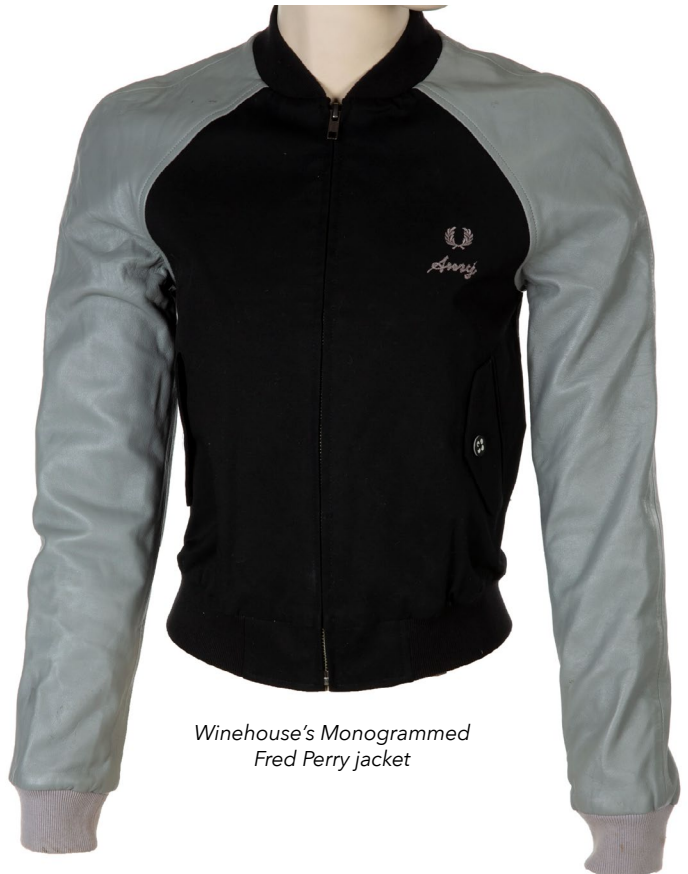
Winehouse's Monogrammed Fred Perry jacket