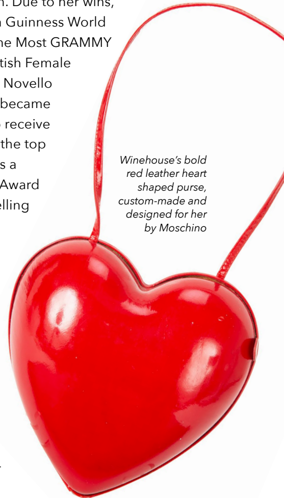
Winehouse's bold red leather heart shaped purse, custom-made and designed for her by Moschino

In 2010, Winehouse and Mark Ronson recorded a cover of Lesley Gore's "It's My Party" to the Quincy Jones tribute album Q Soul Bossa Nostra . On June 18, 2011, Winehouse began her 2011 European tour in Belgrade but the tour was cancelled after one show due to Winehouse's ongoing battle with addiction. Winehouse's last public appearance took place at Camden's Roundhouse in London on July 20, 2011, when she made a surprise appearance on stage to support her goddaughter, Dionne Bromfield, in her performance with the group The Wanted. Winehouse's death on July 23, 2011 stunned the world and her millions of fans. Three days later, Frank , Back to Black and the Back to Black EP re-entered the Billboard 200 at number 57, number 9 and number 152, with the album climbing to number 4 the following week. Winehouse's last recording, "Body and Soul," a duet with legendary singer Tony Bennett - who called Winehouse one of the finest jazz singers he ever collaborated with - recorded for his album Duets II , was released on September 14, 2011 on MTV and VH1 to commemorate what would have been her 28th birthday. On February 12, 2012, the song received the GRAMMY for Best Pop Duo/Group at the 54th Annual GRAMMY Awards®.