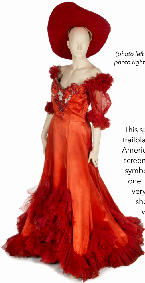
(photo left : Mae West's Diamond Lil gown, photo right: gold lamé headdress)