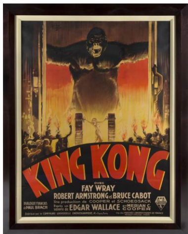
Thursday, March 8, 2018

Props, Posters, Lobby Cards and Life Size Figures from "King Kong", "Terminator 3: Rise of the Machines", "Aliens", "Gone with the Wind", "Jurassic Park", "Batman Returns", "Metropolis" "Dracula", "Breakfast at Tiffany's", "Vertigo" and More Coming Soon to Blockbuster Film Auction Event